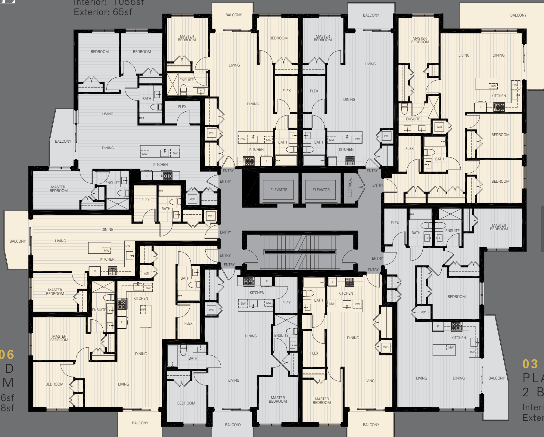
04 PLAN B 1 BEDROOM Interior: 661sf Exterior: 61sf